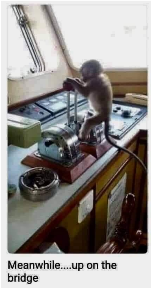
Meanwhile....up on the bridge